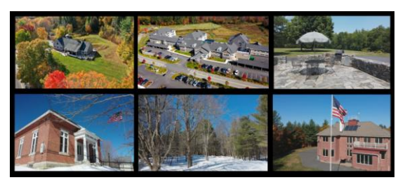
A Minimum of 15 High Resolution JPEG Aerial and Exterior Photographs

The Realtors® Aerial, Exterior and Interior Photograph Package (minimum of 30 Aerials, Exterior and Interior Photographs) includes the following Media Kit: