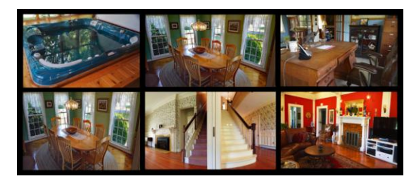
A Minimum of 15 High Resolution JPEG Interior Photographs

A minimum of 15 high resolution JPEG Aerials and Exterior photographs are included. These fully processed and color corrected photographs may be used for press releases, brochures or any digital or printed media as needed. Copies of these photographs may be formatted into more compressed MLS versions if required for internet submission.