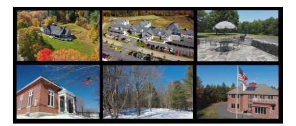
A Minimum of 15 High Resolution JPEG Aerial and Exterior Photographs

The Realtors® Aerial and Exterior Photograph Package (minimum of 15 Aerial and Exterior Photographs) includes the following Media Kit: