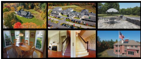
A Minimum of 15 High Resolution JPEG Aerial and Virtual Interior Tour Photographs

Two finished Narrated HD videos using Aerial Images and 3D Virtual Interior Images. Before editing, a storyboard will be submitted for approval prior to publication; the videos will then be reviewed by the Realtor® and modifications will be made if necessary. These include both the Listing Agent's Video as well as the MLS Version Video .