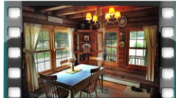
Two Videos, Listing Agent and MLS Version Hosted on our VIMEO® Pro Platform

Two finished Narrated HD videos using Aerial Images and 3D Virtual Interior Images. Before editing, a storyboard will be submitted for approval prior to publication; the videos will then be reviewed by the Realtor® and modifications will be made if necessary. These include both the Listing Agent's Video as well as the MLS Version Video .